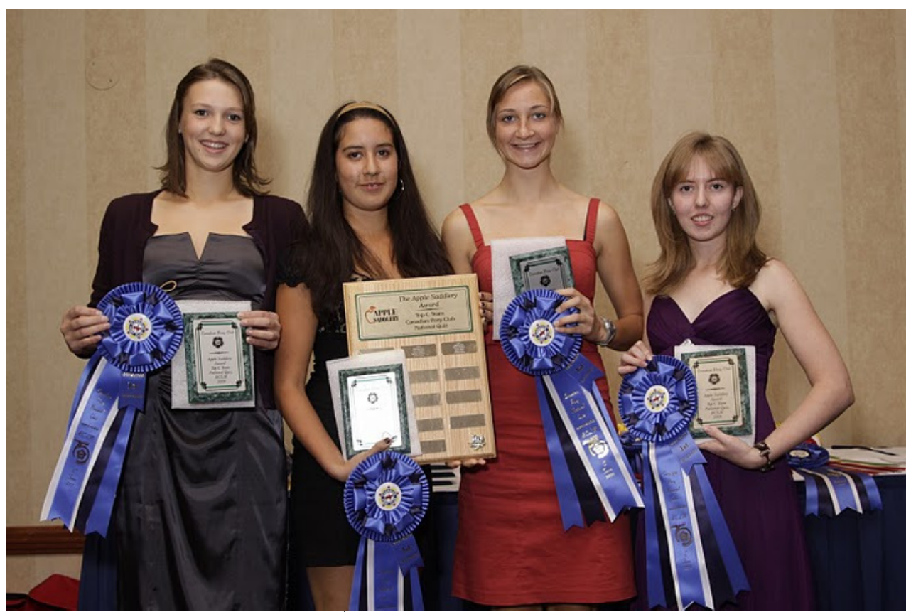
1<sup>st</sup> Place C Team - BCLM