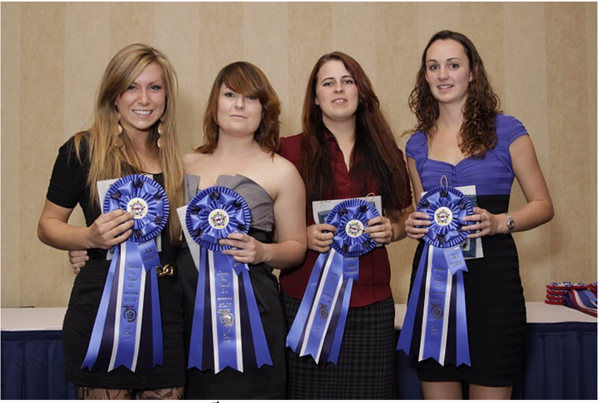
1<sup>st</sup> Place A/B Team - SLOV