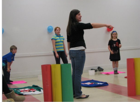
The 3 finalists of the Amazing Race.

Finally, a very special trophy was awarded for the 1<sup>st</sup> time to the club who had earned the most points by participating at the many regional activities. The trophy went out to the Baldur Pony Club! Congratulations!