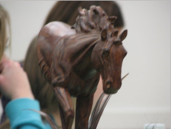
The Participation Trophy