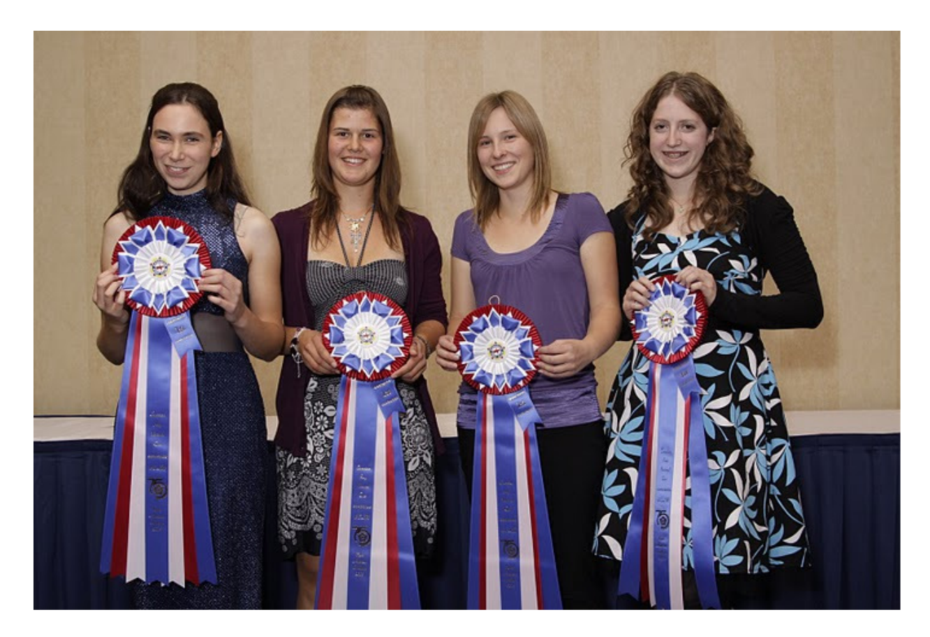
North American Challenge 1st Place - Canada