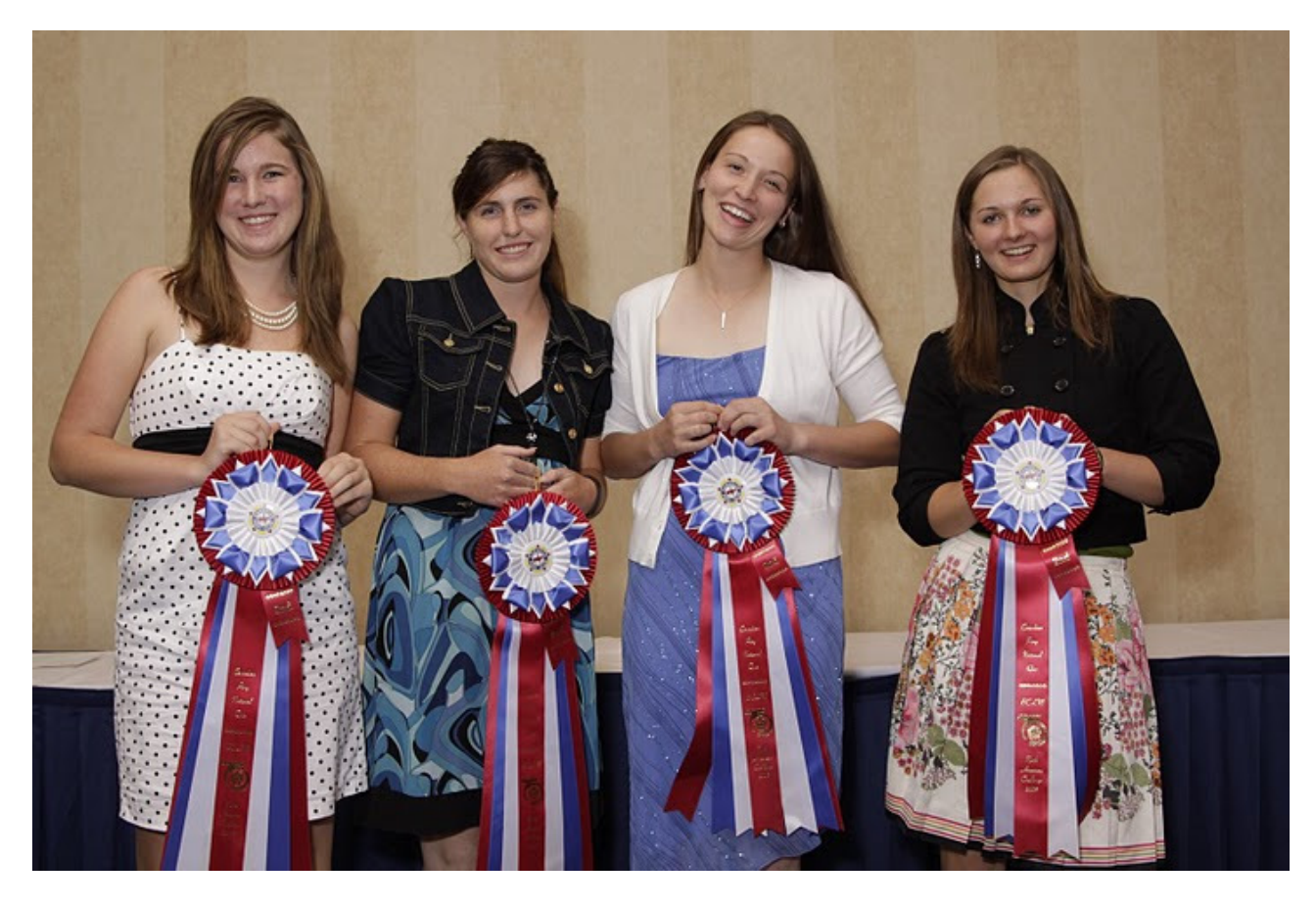
North American Challenge 2nd Place – US