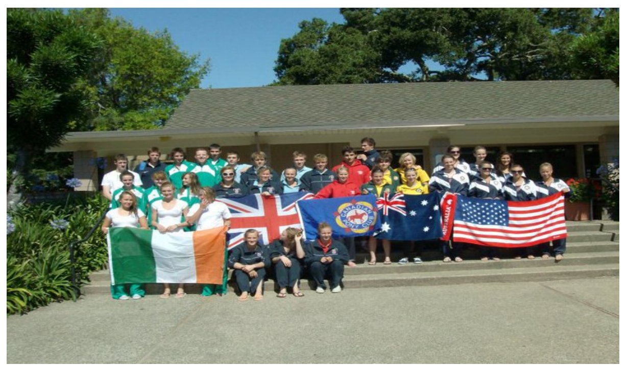
All the International Teams after their Team scramble swim. August 2010