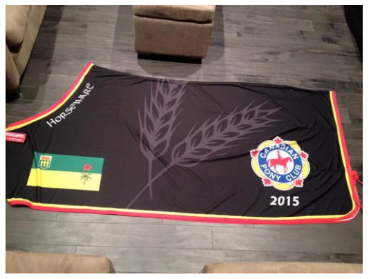
Coolers for top 3 riders