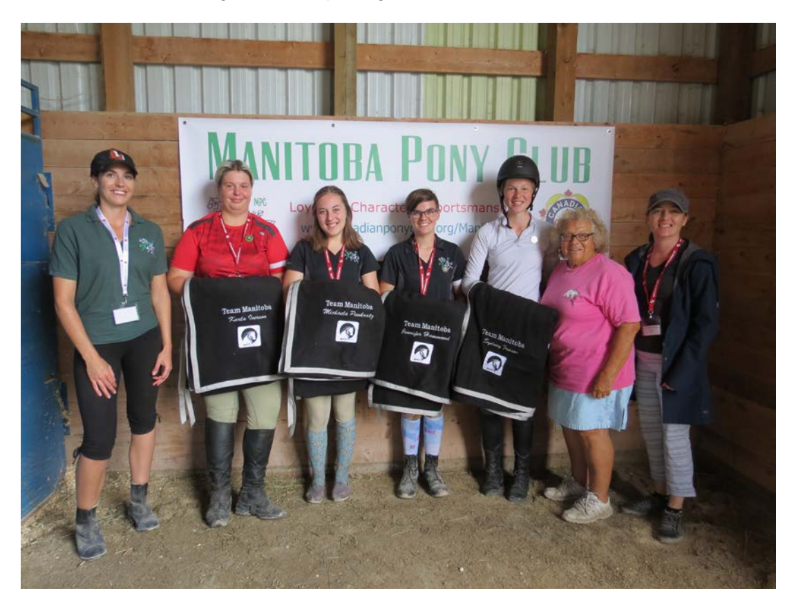
Manitoba Pony Club Team Team blankets sponsored by MHC

The Manitoba Pony Club event committee and volunteers thoroughly enjoyed hosting this event and hope that everyone had as much fun attending as we did putting it on!