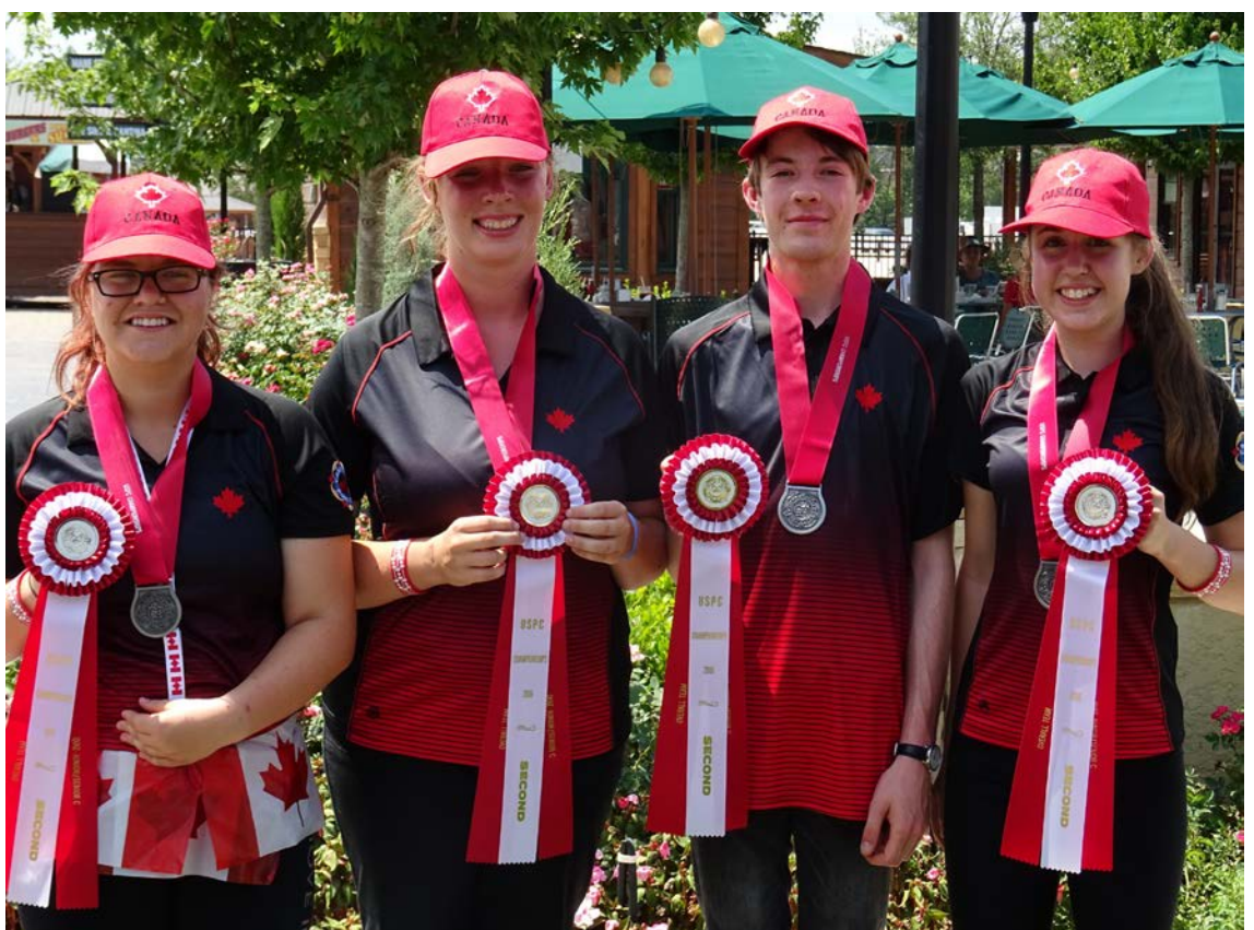
Second Place, Silver Medalists Well Done Team Canada!