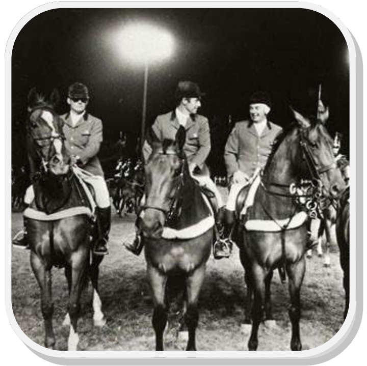
1968 Equestrian Team